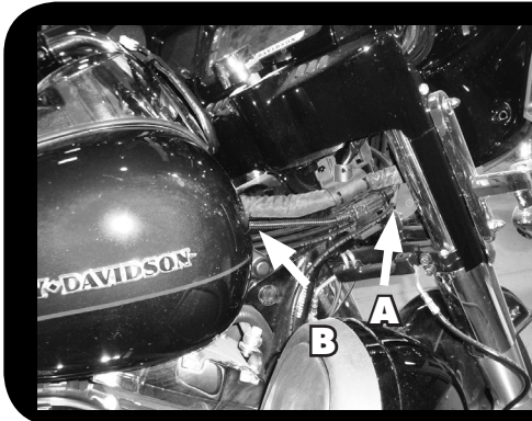
Figure 1.3 - Stock Harness and Amplifier's Harnesses Passing From Fairing To Just In Front Of Tank (Arrow A). Cable Tying the 2 Amp Harnesses To The Main Bike Harness Just In Front Of The Tank (Arrow B) Allows The Amp Harnesses To Go Up Towards The Tank's Chrome Console Easier And Makes For a Cleaner Install.

Step #1: The power/ground harness and supplied long rear harness for Ultras will pass together under the inner fairing where the main wire harness passes through on the brake side of the bike. Loosen the tank's "chrome console" and run wires up and over the gas tank, but under the tank's chrome console. There is a provision on the front of the tank console for wires to pass. NOTE: Although not necessary, the power and rear harnesses can go under the gas tank if you choose to remove and re-install the tank. With the tank removed, you will see a factory provision where wires pass over the bike's frame. Install the amplifiers wires in this provision.